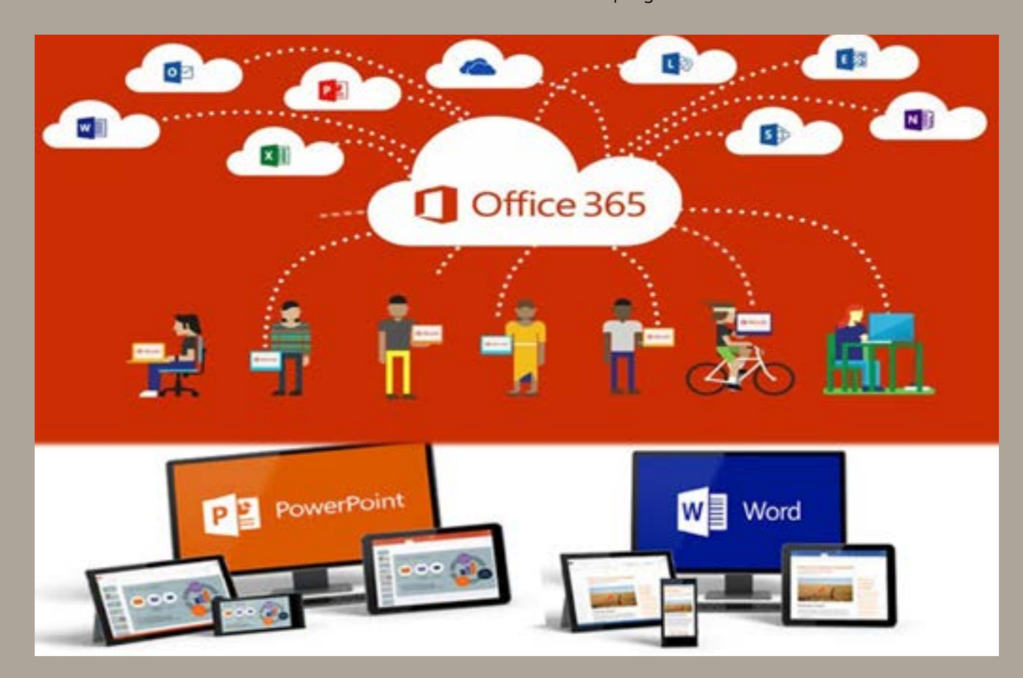
Visit <a href="http://www.nwu.ac.za/it/office365">http://www.nwu.ac.za/it/office365</a> for more information.